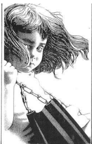
We're not here to just make a living... We're here to make a difference.

Inclusion: Inclusion is defined as the process of increasing the presence, participation and achievement of all students in schools, with particular reference to those groups of students who are at risk of exclusion, marginalisation, or underachievement (Booth & Ainscow, 2002)